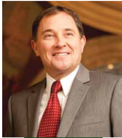
GARY R. HERBERT Utah Governor